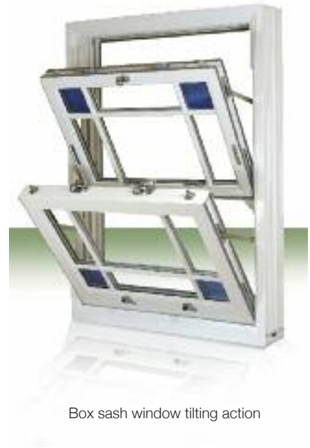
Box sash window tilting action

The thermal properties of PVCu are excellent and these windows can be supplied in a wide range of finishes. From six feet away it is extremely difficult to tell if the window is timber or PVCu.